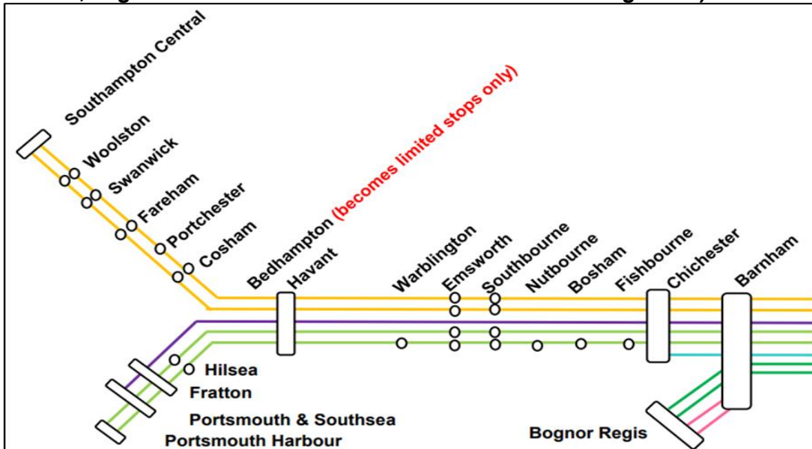
Figure 3 – Post consultation final West Coastway services from June 2024

(Please note that "Information Only" reports do not require Integrated Impact Assessments, Legal or Finance Comments as no decision is being taken)